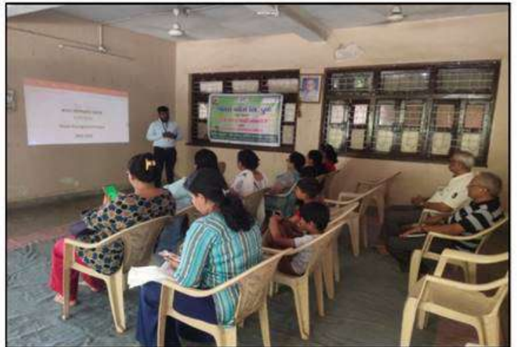
Sadhana Society, Hadapsar