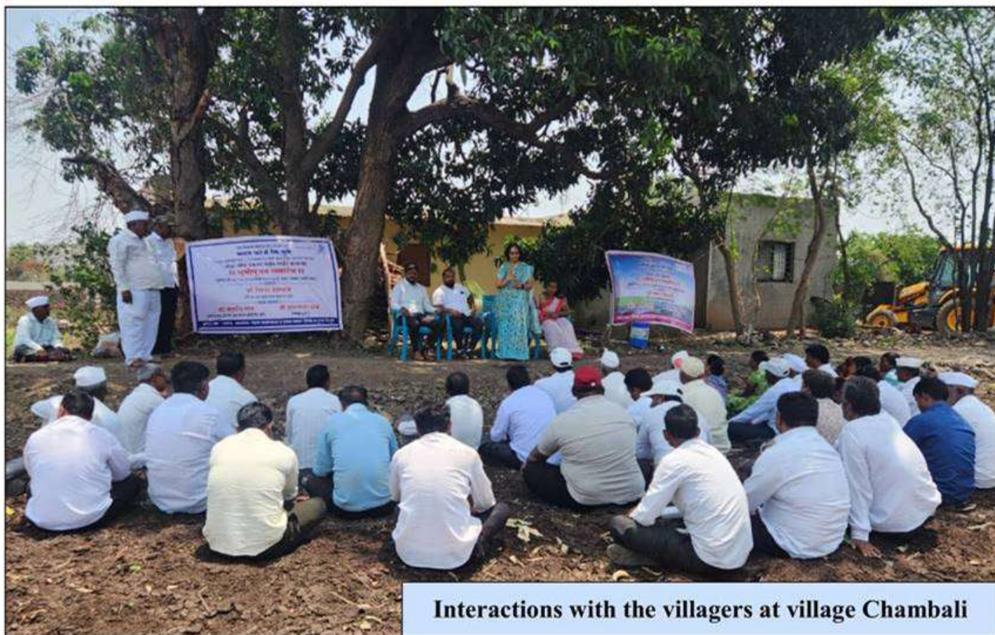
Interactions with the villagers at village Chambali