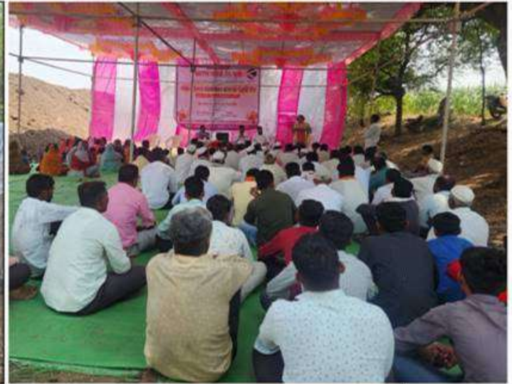
Site visit & Interactions with the villagers at village Wagholi