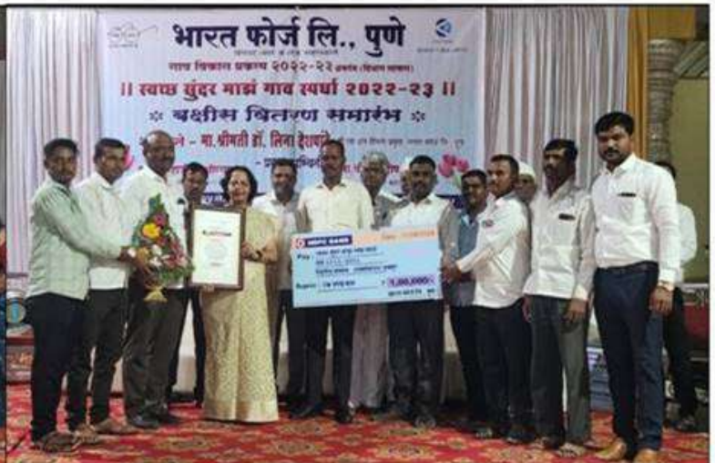
Second prize winner village Jaypur