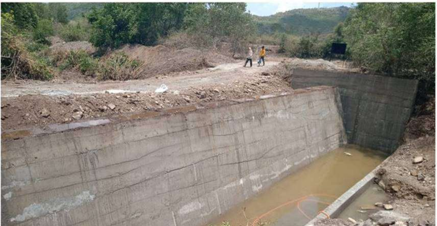
Construction & desilting of bandhara at Village Jaypur. water conserved by this project will be useful for drinking and agriculture Purpose.