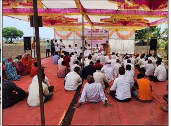
Site visit & Interactions with the villagers at village Samangaon