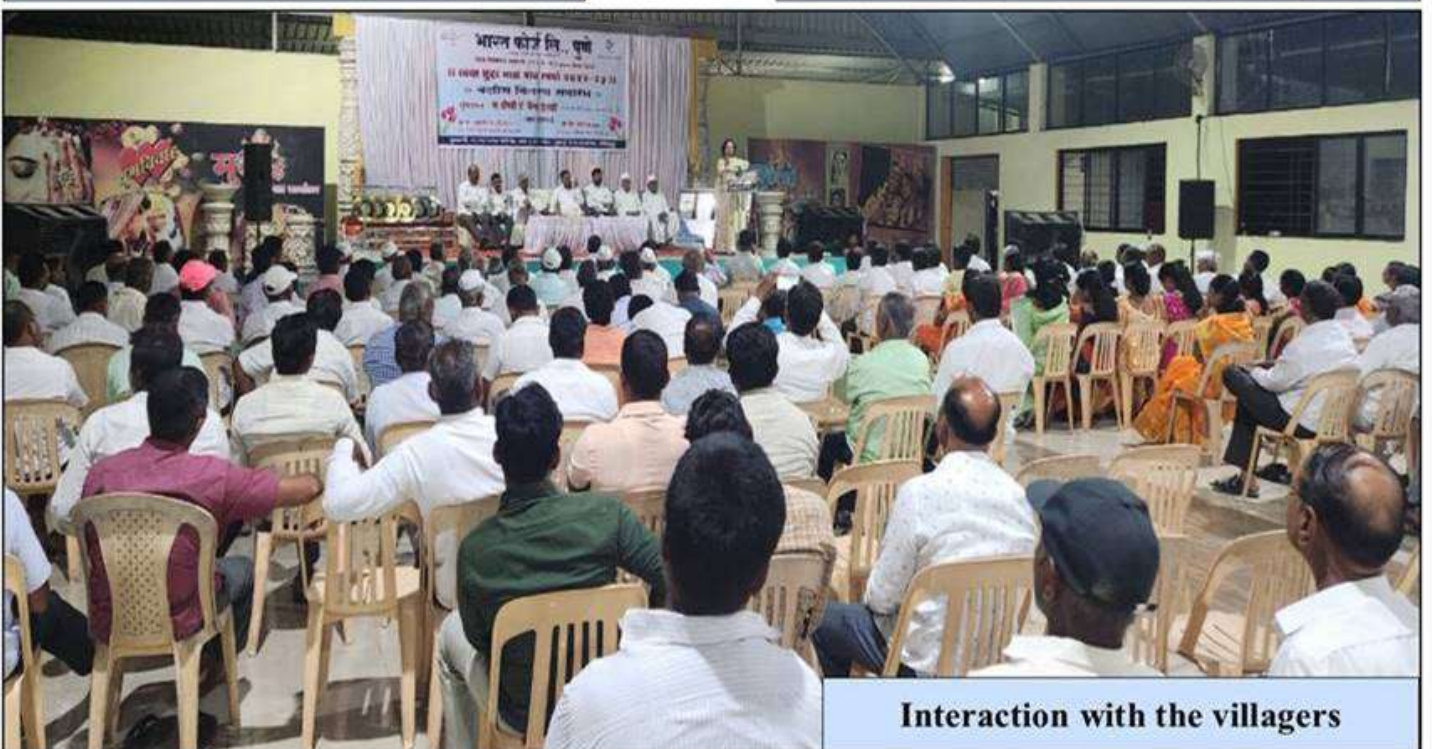
Interaction with the villagers