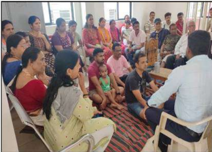
Binawat Township Society, Hadapsar