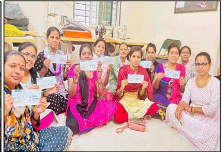
Community women receiving remuneration for stitching work