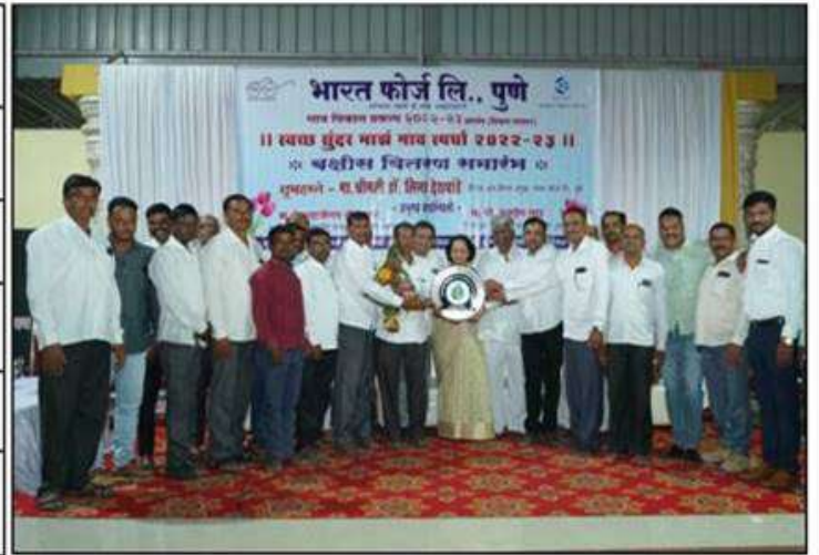
Platinum rating - Dhamner