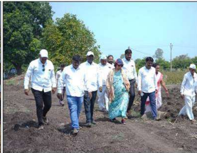
Inauguration of lift irrigation pipeline work & 'शिवार फेरी' with the villagers at village Chambali