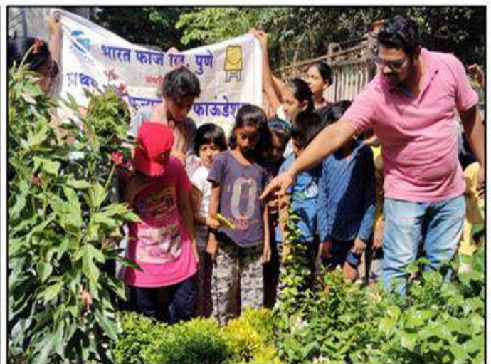
Educational trip to plant nursery