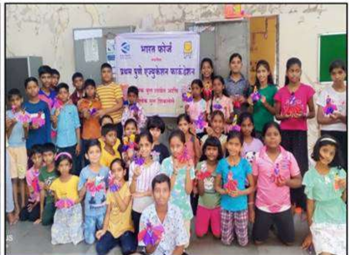
Different activities during summer camp