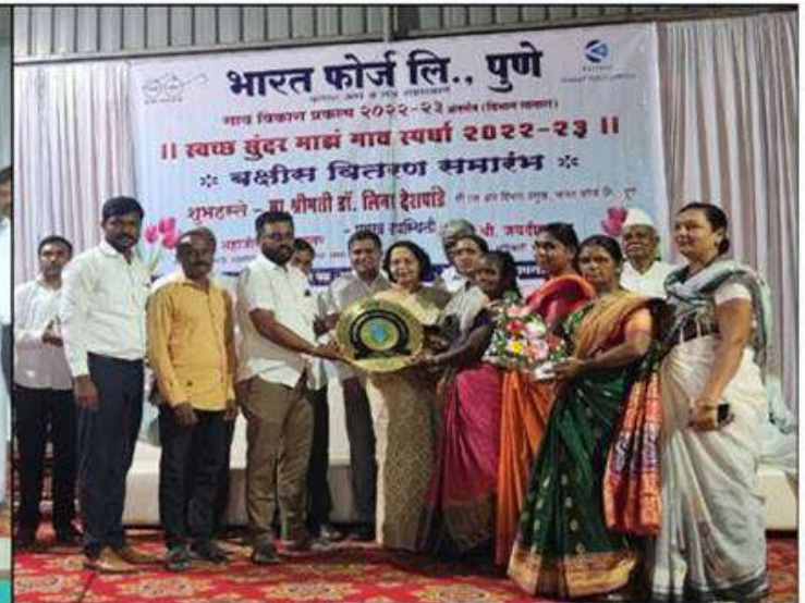
Gold rating - Takale