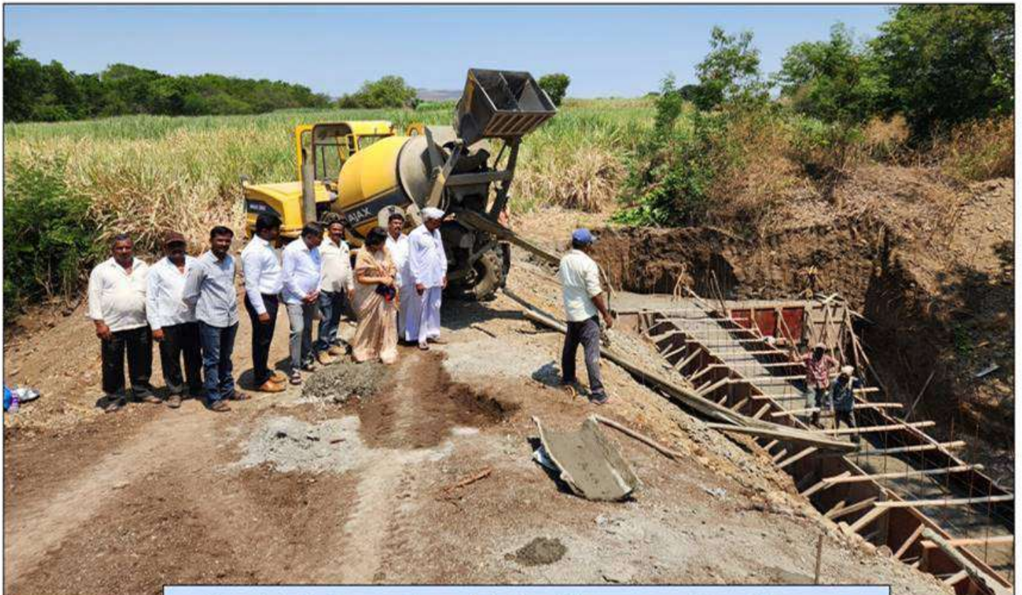
Site visit & Interaction with the villagers at village Khatgun.