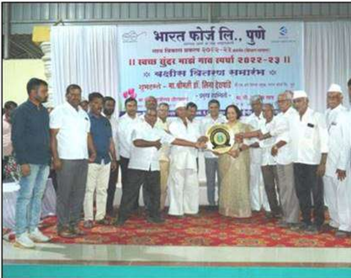
Gold rating - Saygaon