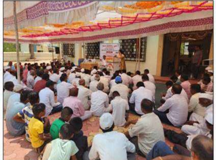
Interaction with the villagers at village Jaypur.