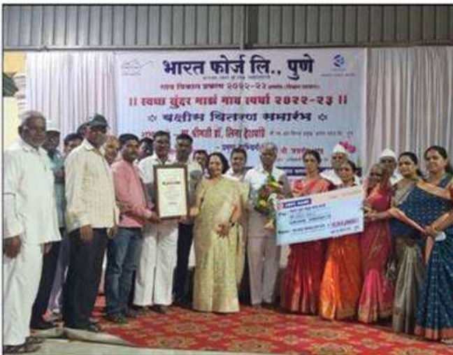
First prize winner village Rui