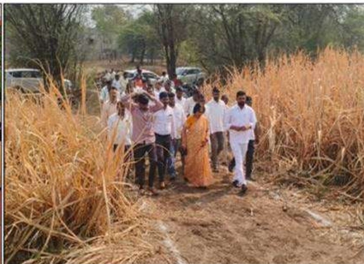
Site visit & Interactions with the villagers at village Warur