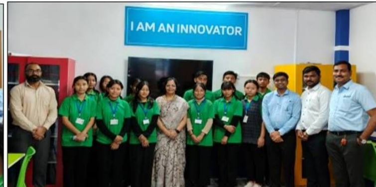
School Visit at Kiruphema - Kohima