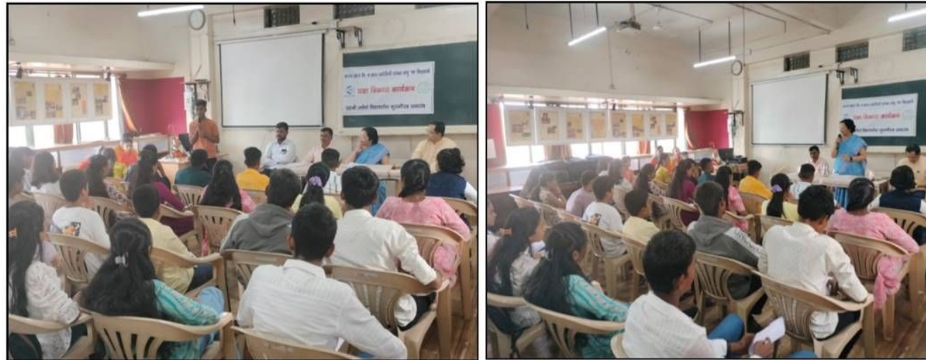
Felicitation of the students