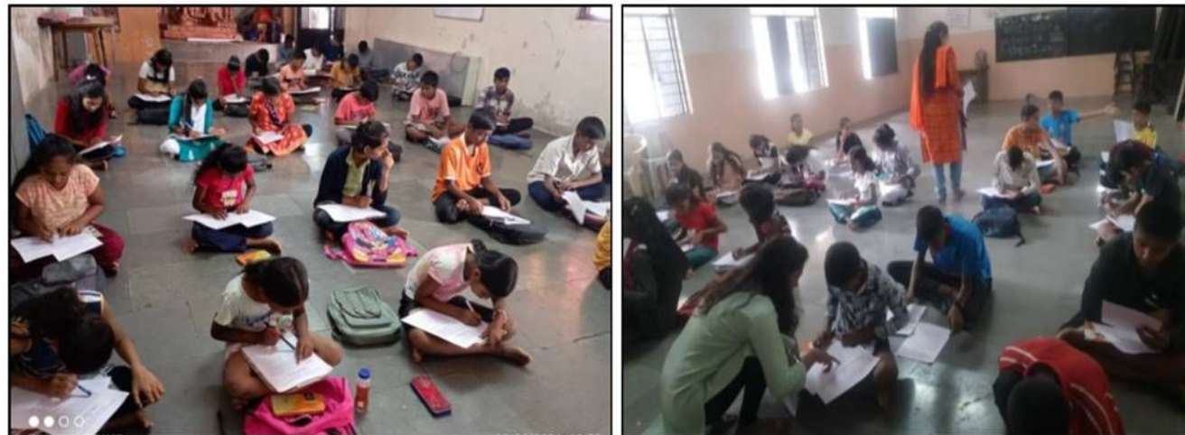
Examination for new enrollment