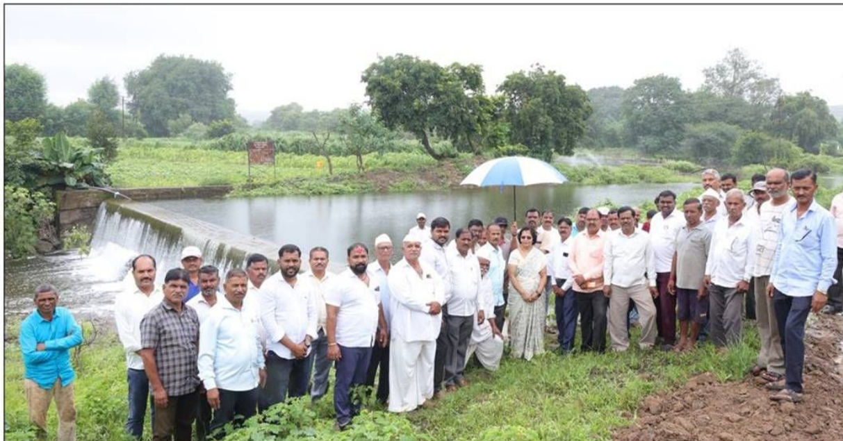
Jalpoojan Sohala' - Cement & Mati nala bandhara at Village Hiware