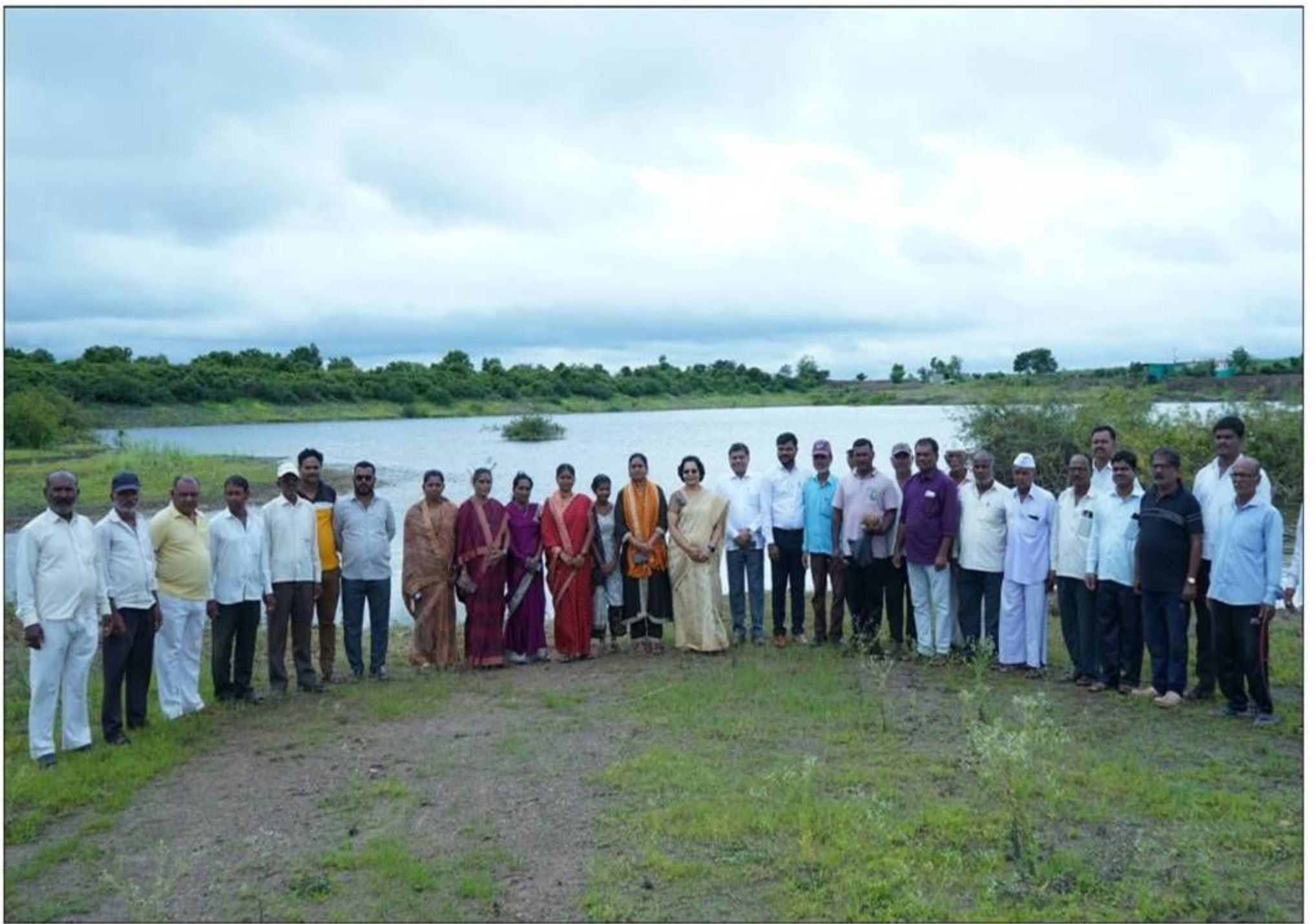
Jalpoojan Sohala - Desilting of Pazar talav at village Kalambi