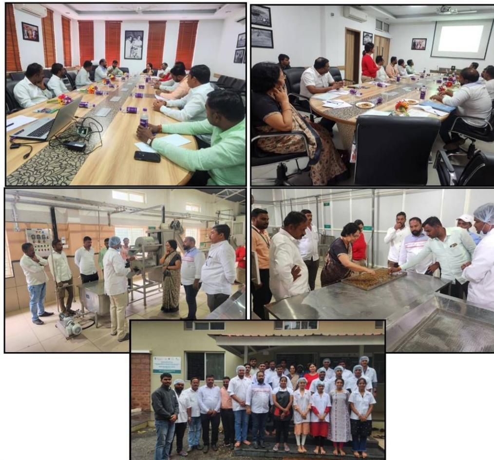
Exposure visit of farmers at Food Processing Center, Baramati