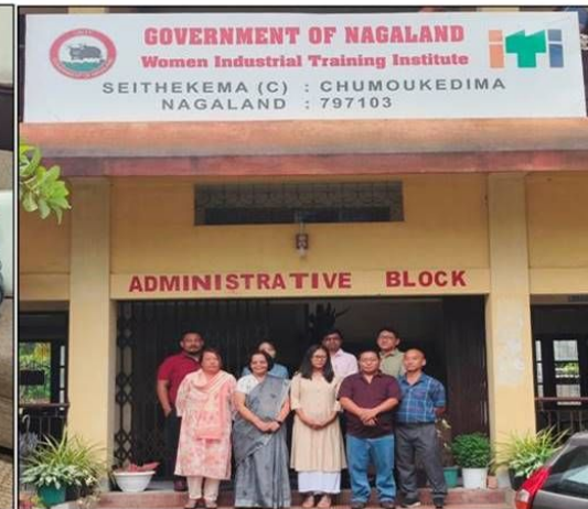
Visit to women's ITI - Dimapur