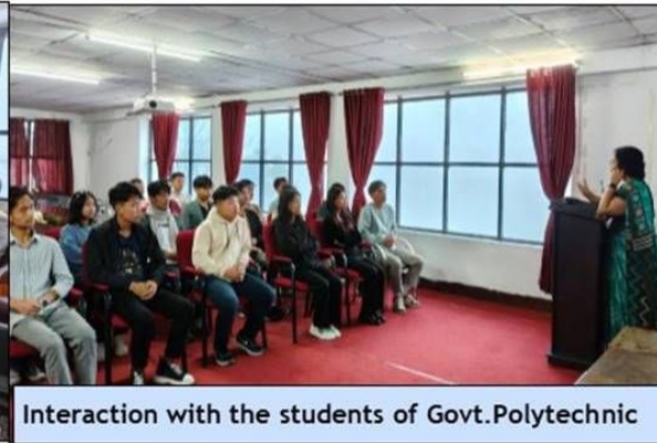
Interaction with the students of Govt. Polytechnic