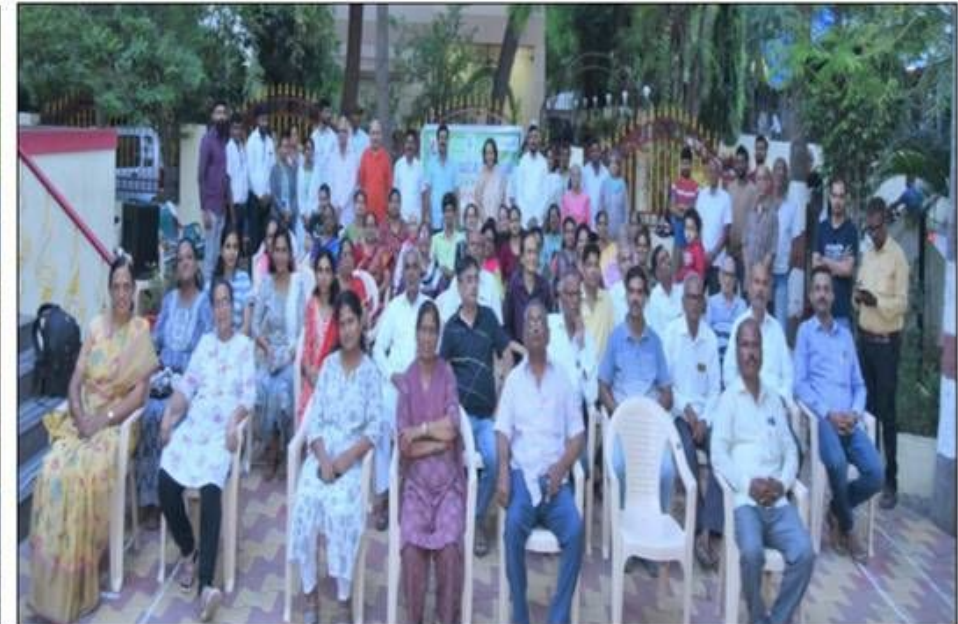
Inauguration of the CP installation initiative