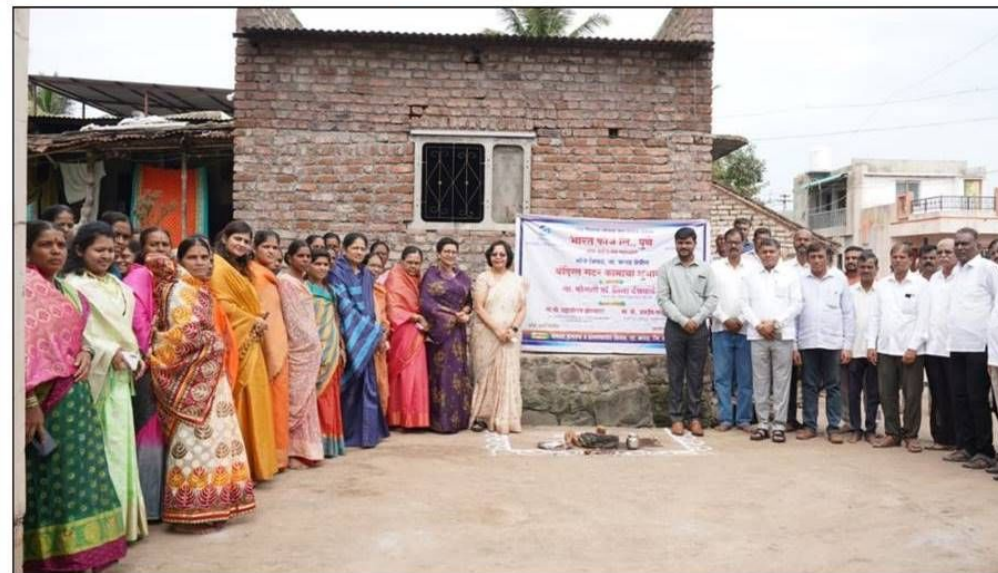
Inauguration of underground gutter at Village Kival Most of the work in the villages in the first phase has now completed, the remaining part of the internal gutter will going to complete soon. The entire village is going to have an internal gutter system.