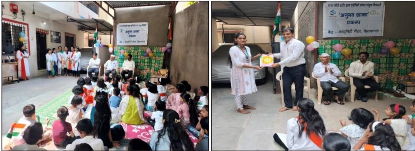
Cultural activity on 15th August