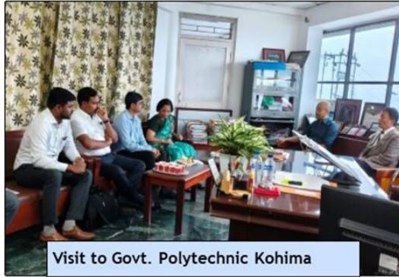
Visit to Govt. Polytechnic Kohima