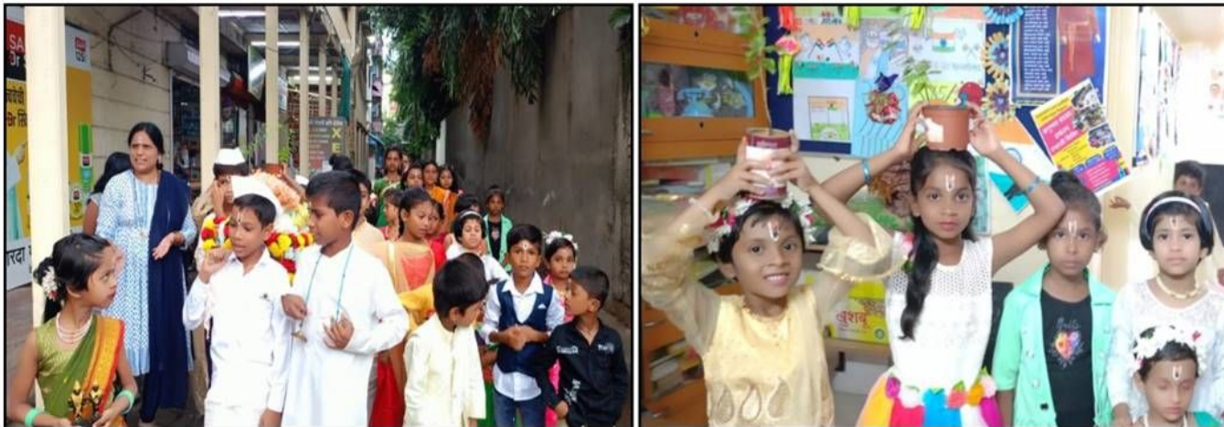
Celebrating Palkhi Sohala