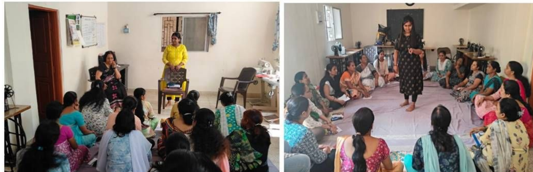
Session on self awareness