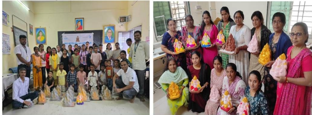
Workshop on Ecofriendly Ganesh Idol making