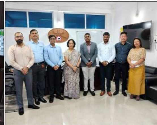
Meeting with Principal Director, School Education