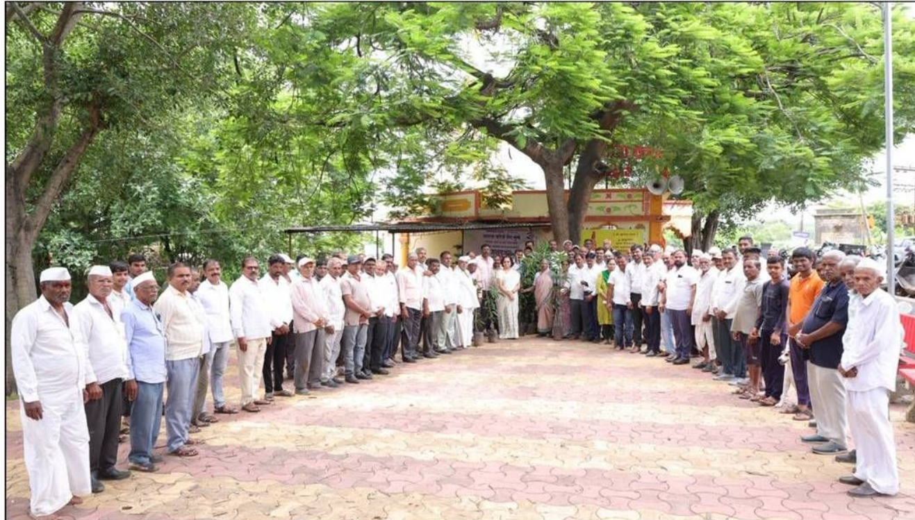
Tree plantation & Sapling distribution to the farmers