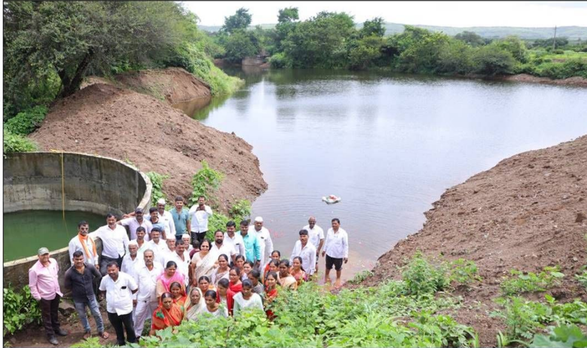
Jalpoojan Sohala' - Cement & Mati nala bandhara at Village Chambali