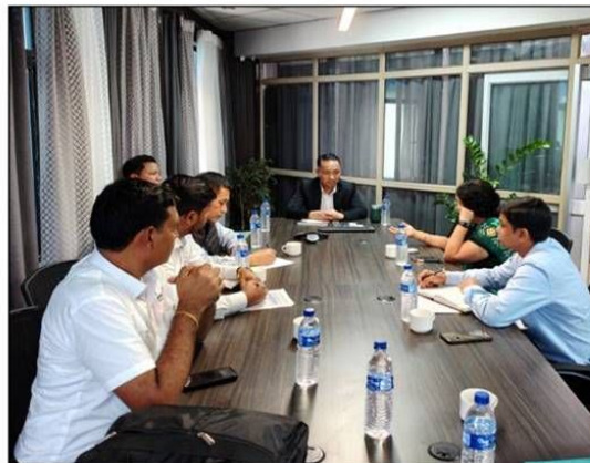
Meeting with Director of Technical Education, Nagaland