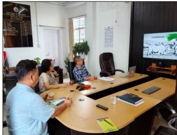
Meeting with Director of Skill Development & Entrepreneurship