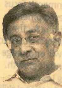
BABA N KALYANI