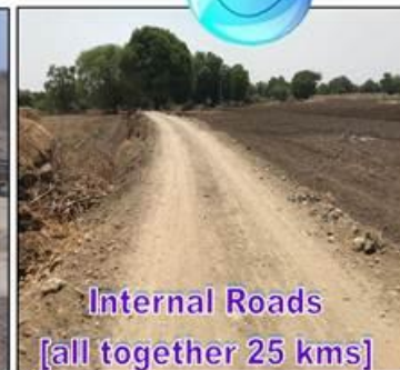
Internal Roads [all together 25 kms]